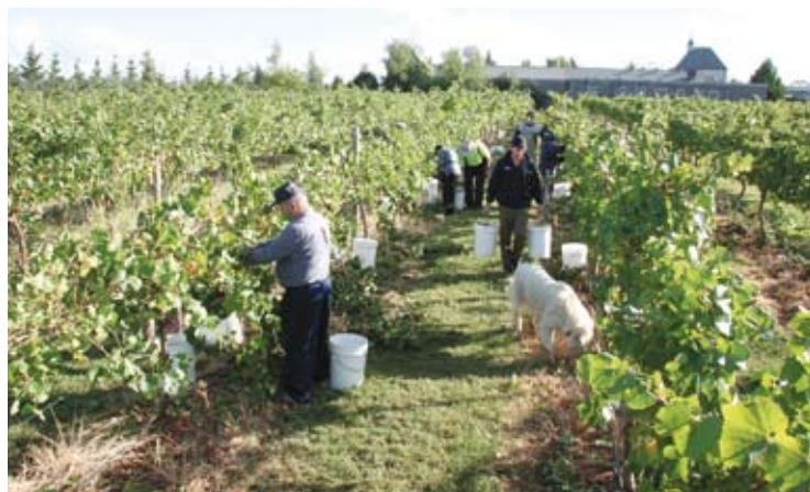
■ Witchmount Estate, Leakes Road, Rockbank

Witchmount worked closely with a number of other local businesses to bring recycled water to Rockbank, including Trethowan Nursery, Galli Estate Winery, and Melton Valley Golf Club. For more information on Witchmount, please visit their website: www.witchmount.com.au