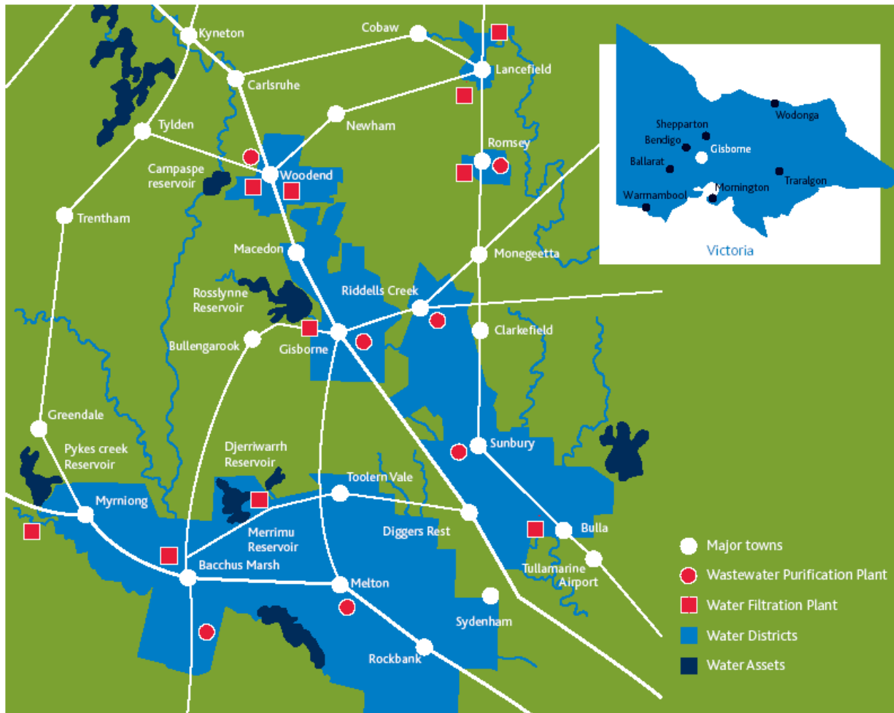
■ Figure 1: Western Water Supply Area